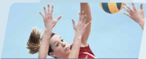
SPORTS AND MULTI-PURPOSE HALLS