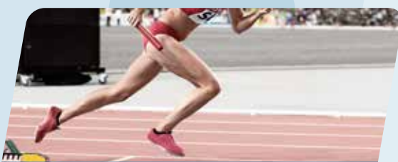
TRACK AND FIELD FACILITIES